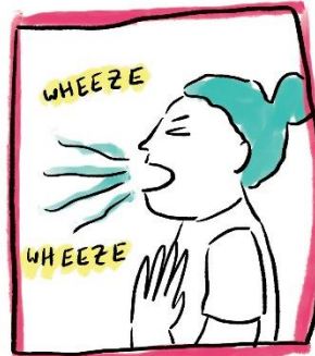
Kinda hard to breathe

Most people who have gotten sick with this coronavirus have had a mild case.