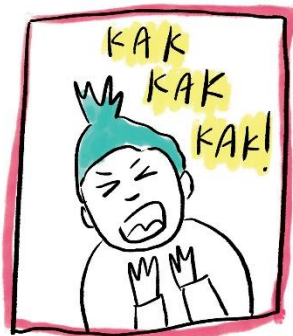
Dry, itchy cough

A lot of the symptoms are similar to the flu (which you might have had before!)